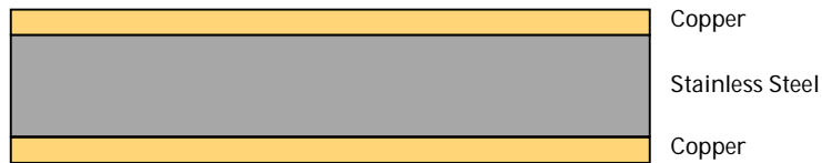
Cross section of CopperPlus

CopperPlus is a metallurgically bonded metallic composite strip produced by roll bonding. The roll-bonding process is based on solid-state welding technology, requiring no adhesive or brazing alloys to achieve a clean, permanent, bond. The clad material has excellent bond integrity due to the nature of the metallurgical bond that develops between the copper and stainless steel layers.